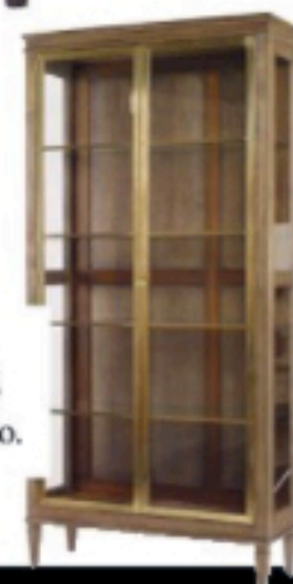
9. CENTURY FURNITURE'S Brass front curio.