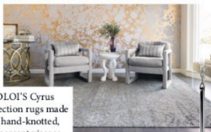
1. LOLOI'S Cyrus Collection rugs made with hand-knotted, 100-percent viscose from bamboo.

9. Divide and Conquer Interesting curios, étagères and cabinets re-emerge to subtly define spaces in open plan homes and draw interest to cozy nooks.