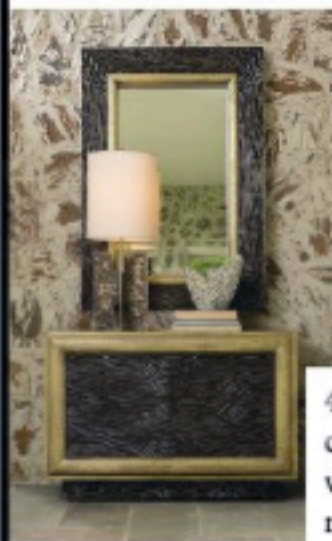
4. GLOBAL VIEWS Forest mirror and cabinet from the Studio A collection wrapped in brass, hand-embossed and rubbed with an oiled bronze finish.