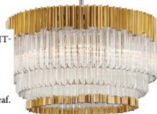
2. CORBETT LIGHTING'S Charisma chandelier of clear triedi crystal prisms complemented by hand-applied gold leaf.