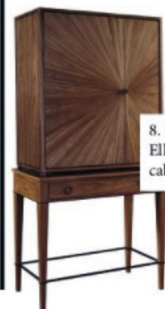
8. HENREDON'S Ellington circle bar cabinet.