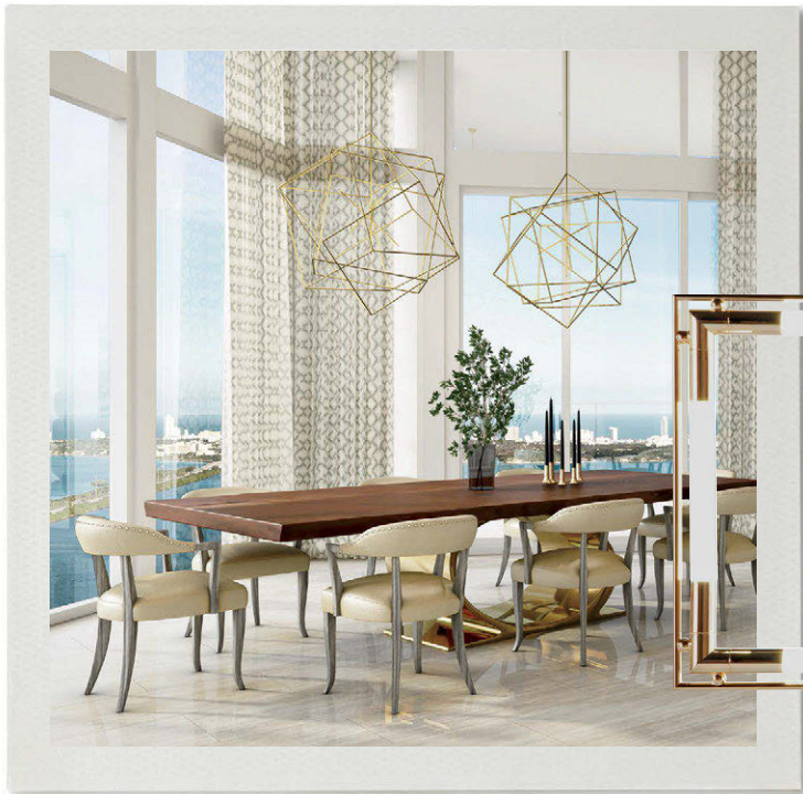
Thom Filicia designed the interiors for Biscayne Beach, slated to open in March 2016; it's the designer's first residential project in Miami.