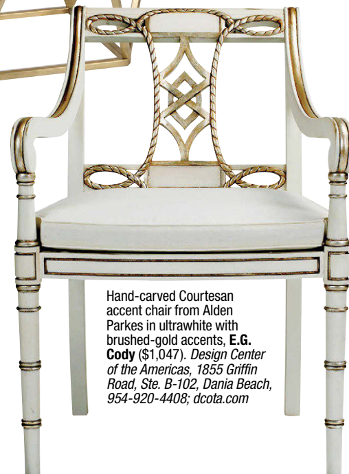
Hand-carved Courtesan accent chair from Alden Parkes in ultrawhite with brushed-gold accents, E.G. Cody ($1,047). Design Center of the Americas, 1855 Griffin Road, Ste. B-102, Dania Beach, 954-920-4408; dcota.com