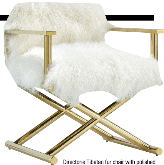
Directorie Tibetan fur chair with polished brass, Mitchell Gold + Bob Williams ($3,020). 3800 N. Miami Ave., Miami, 786-609-9920; mgbwhome.com