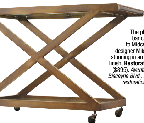
The plated-steel Milo bar cart, an homage to Midcentury furniture designer Milo Baughman, is stunning in an antiqued brass finish, Restoration Hardware ($895). Aventura Mall, 19575 Biscayne Blvd., 305-935-1253; restorationhardware.com

“A mix of materials is very important; adding those layers to your space is going to give it warmth, depth, personality, and character, the things that can sometimes get lost, especially in really modern, glitzier environments,” says interior designer Thom Filicia, who designed the Architectural Digest Oasis at The James during December’s Design Miami, and who is currently at work on Biscayne Beach, the designer’s first Miami residential project, slated to open in East Edgewater in 2016. “When I look at the three things that really define the Miami aesthetic, I find the glitz to be the one you need the smallest amount of—a little goes a long way.” With Biscayne Beach, Filicia is straddling the line between modern, sophisticated urban life, and respecting the relaxation, easiness, and casual elegance that come with living in a waterfront community. “A lot of what we have traditionally seen in Miami is a little bit ‘slick,’ white, urban, international, glitzy,” says Filicia, who moved away from that “one-dimensional” aesthetic by mixing elements like woods, stones, and metals in a variety of finishes. “There’s lots of room for layers, which I think is where Miami is going. It’s just softer and more approachable, but it still feels at home in the city.” Here, a look at ways you can capture that multidimensional aesthetic in your own Miami abode. OD