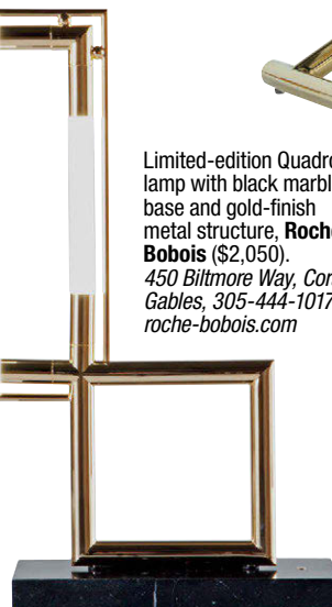
Limited-edition Quadro lamp with black marble base and gold-finish metal structure, Roche Bobois ($2,050). 450 Biltmore Way, Coral Gables, 305-444-1017; roche-bobois.com