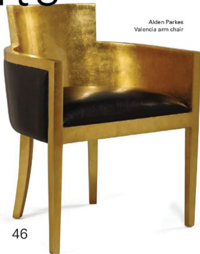
Alden Parkes Valencia arm chair