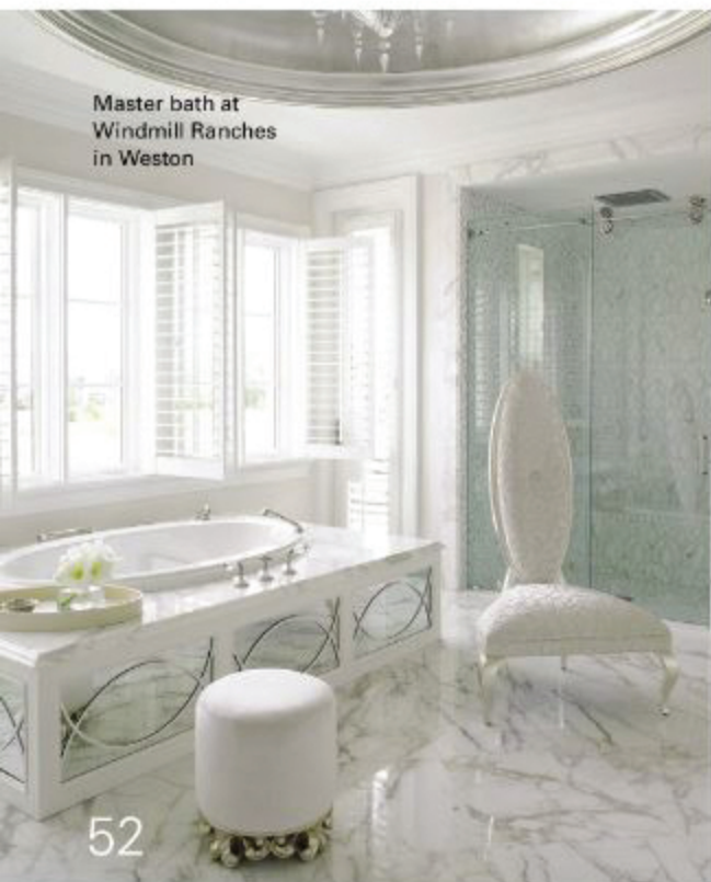
Master bath at Windmill Ranches in Weston